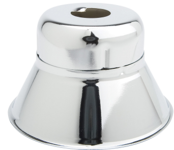
STYLE 401 TWO-PIECE ESCUTCHEON