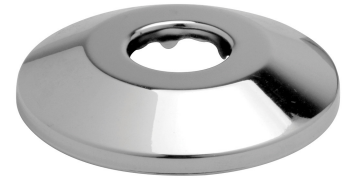
STYLE 65 ONE-PIECE ESCUTCHEON

The owner is responsible for maintaining their fire protection system and devices in proper operating condition. Contact the installing contractor or product manufacturer with any questions.