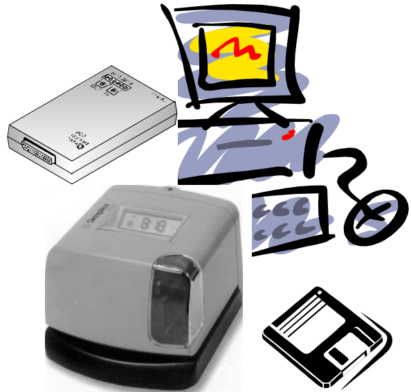
SimSYNC Software and Converter Solution