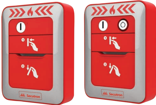
MRM-810MP(U) 1 Stage