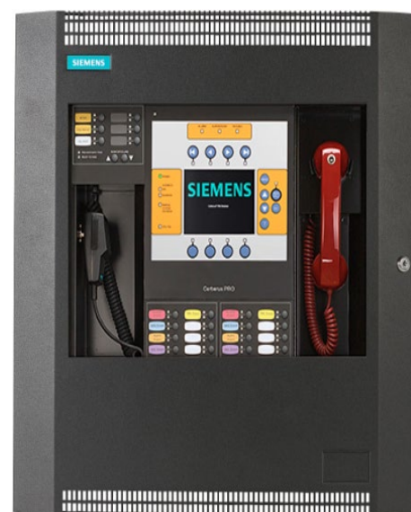
Model FCM2041-U3 Operator Interface Unit mounted in a Model CAB1 enclosure

NOTE: Alternate-language labels are ordered separately.