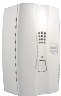
GD-2B (Combustible Gas)

The Macurco GD-2B and GD-2A combustible gas detectors are reliable, lightweight, and aesthetically pleasing gas detectors made to keep you and the people you care about safe from harmful gases in residential and light commercial applications. They are low-voltage gas detectors designed for use with fire and security systems. The GD-2A is UL 2075 Listed for use in residential and commercial applications and is also approved by the California State Fire Marshal.