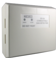
GD-2A (Combustible Gas)

The Macurco GD-2B and GD-2A combustible gas detectors are reliable, lightweight, and aesthetically pleasing gas detectors made to keep you and the people you care about safe from harmful gases in residential and light commercial applications. They are low-voltage gas detectors designed for use with fire and security systems. The GD-2A is UL 2075 Listed for use in residential and commercial applications and is also approved by the California State Fire Marshal.