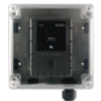
Weatherproof Housing Kit (Detector sold separately)