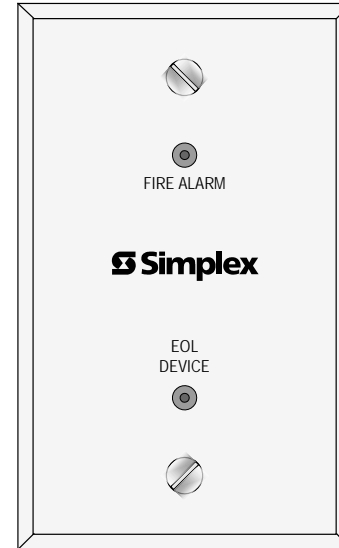
End-of-Line Relay Cover Plate