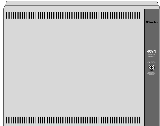
4081 Series Battery Cabinet with Charger

Depleted battery. Depleted battery warnings and selectable or standard battery cutout features of the connected fire alarm control panels are maintained when connected to the 4081 remote battery charger.