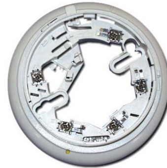
4098-5207 5" Addressable Sensor Base

4098-5207 5" Addressable Sensor Bases are compatible with a variety of standard ceiling and wall mount backboxes. Features include: Remote LED connections, Anti-Tamper facility, Park position and address flag holder, and integral breakout locking key.