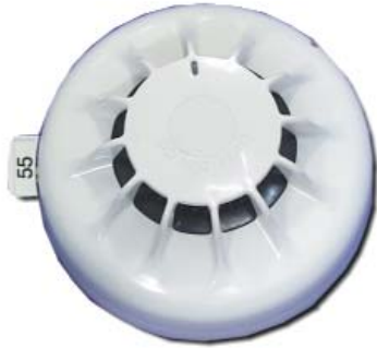
4098-5202 Photoelectric Sensor

4098-5202 Photoelectric Sensor incorporates a unique optical chamber design with a signal-to-noise ratio that provides high resilience to dust, dirt, and small insects for reduced service cost. The unique chamber cover actually draws slow moving smoke into the chamber to provide more responsive detection.