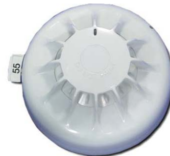
4098-5201 Heat Sensor

4098-5201 Heat Sensor. The 4098-5201 Heat Sensor returns analog temperature readings to the fire alarm control panel for evaluation. Construction includes a high quality thermistor with very low thermal mass allowing the sensor to provide fast and accurate temperature readings for heat detection determination.