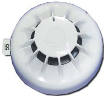
4098-5203 Photoelectric Sensor with Heat Sensing

4098-5202 Photoelectric Sensor incorporates a unique optical chamber design with a signal-to-noise ratio that provides high resilience to dust, dirt, and small insects for reduced service cost. The unique chamber cover actually draws slow moving smoke into the chamber to provide more responsive detection.