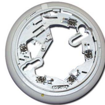
4098-5208 Addressable Isolator Base

4098-5207 5" Addressable Sensor Bases are compatible with a variety of standard ceiling and wall mount backboxes. Features include: Remote LED connections, Anti-Tamper facility, Park position and address flag holder, and integral breakout locking key.