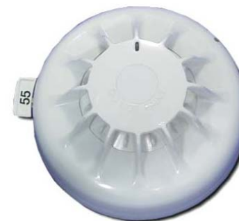
4098-5201 Heat Sensor