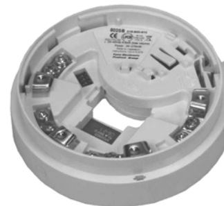
4098-5209, 4098-5210, and 4098-5211 Sounder Bases