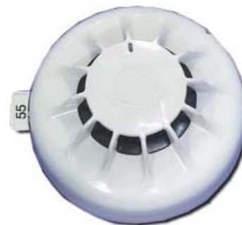
4098-5202 Photoelectric Sensor and 4098-5203 Photoelectric Sensor with Heat Sensing

Detection Modes. MX Sensors communicate to the MX Loop Module using MX Technology communications. This allows each detector to operate in one or two of several detection modes, thus allowing it to be easily optimized to the risk.