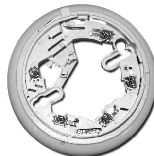
4098-5207 Standard Base and 4098-5208 Isolator Base