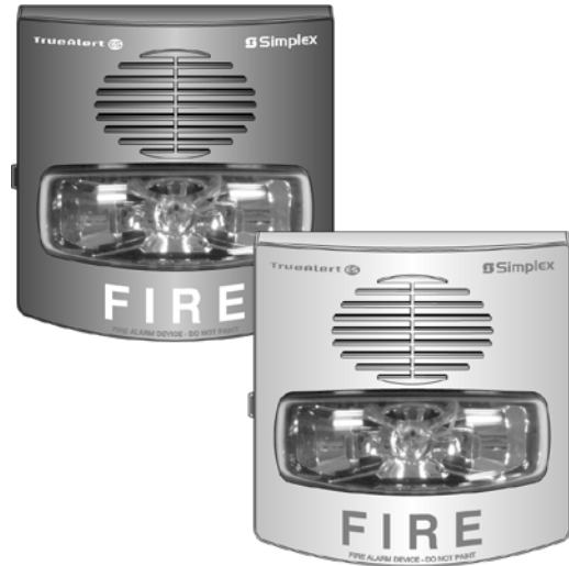
TrueAlert ES Multi-Tone Addressable A/Vs are Available in Red with White Lettering and White with Red Lettering