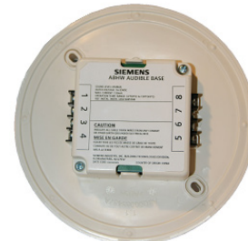
Model ABHW-4S (Back View)