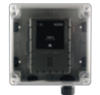
Weatherproof Housing Kit (Detector sold separately)