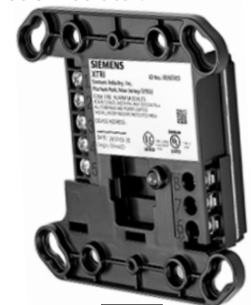
Model XTRI-D | XTRI-R | XTRI-S Intelligent Device Interface Module

This single-input interface module can only monitor and report the status of a N.O. or N.C. contact.