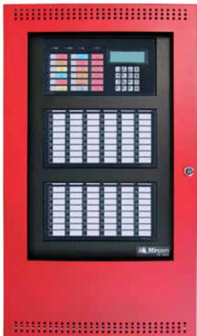
FX-3500 with two optional RAX-1048TZDS modules