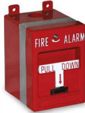
RMS-EXP ( )