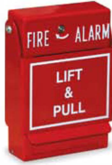
RMS ( ) LP