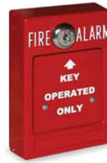
RMS ( ) KO