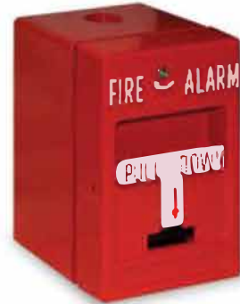
RMS ( ) WP