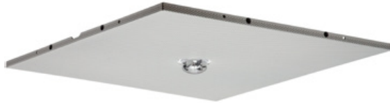
Front View of Strobe