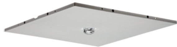
Speaker Strobe shown (as installed and close-up)